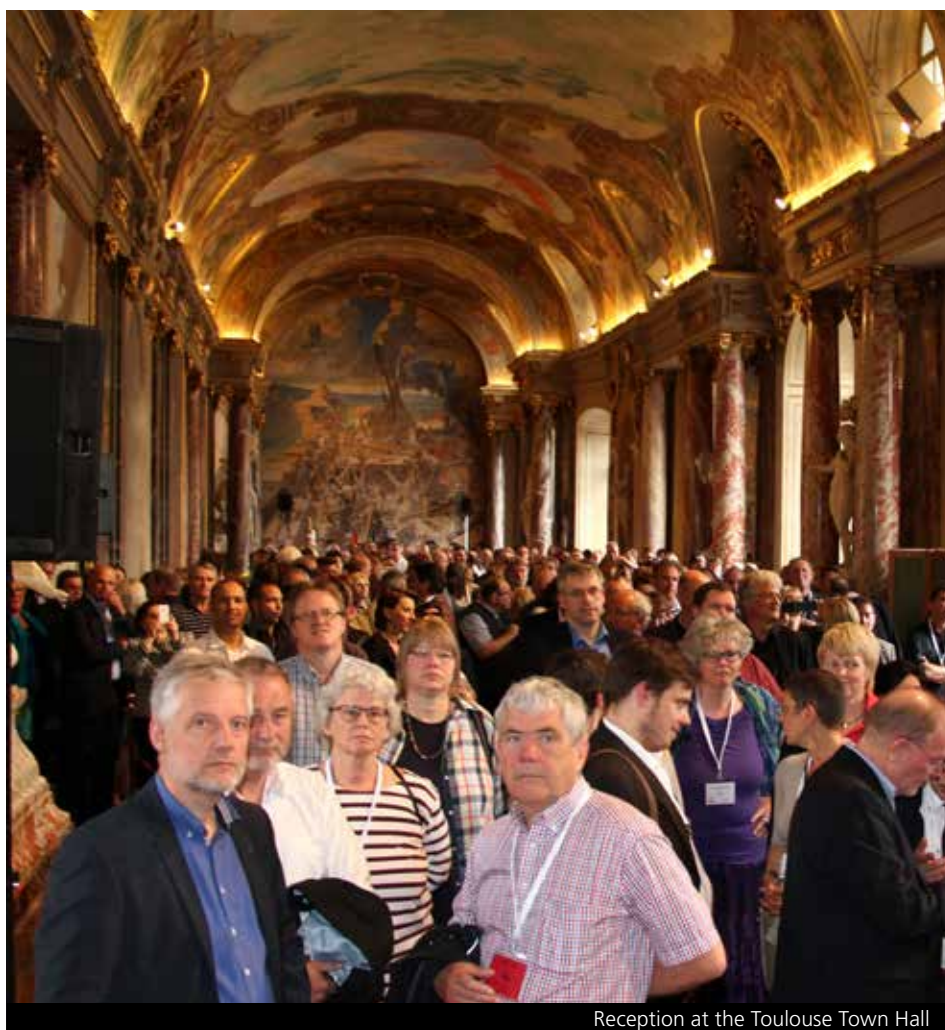
Reception at the Toulouse Town Hall