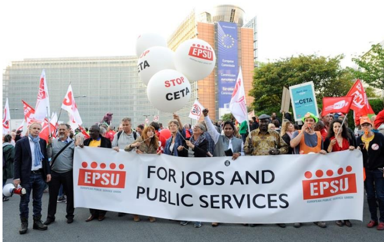
Brussels 20 September no to CETA demo