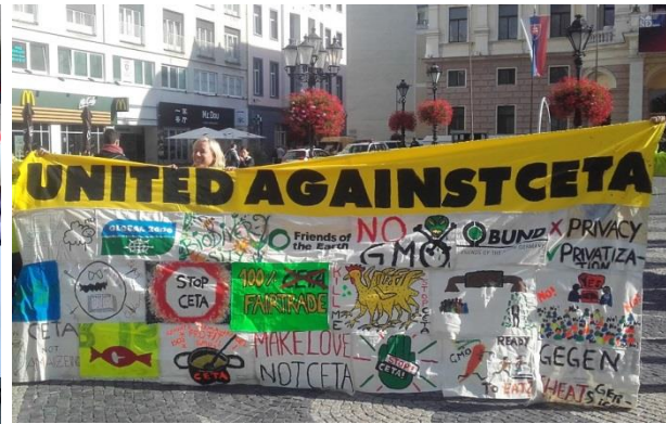
Bratislava 23 September anti CETA demo