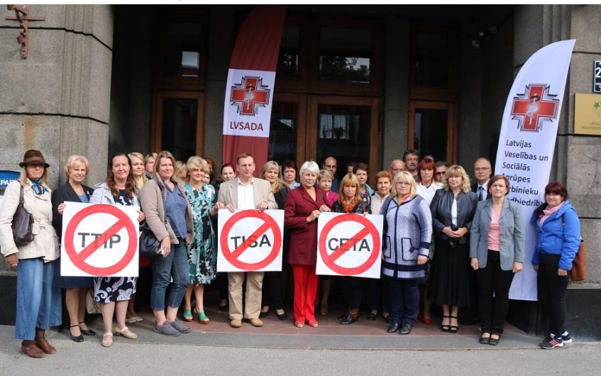
Latvian health workers