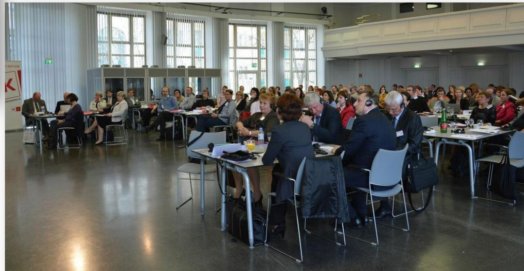
Picture with the participants from 18 EU and non-EU countries