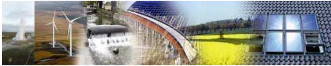
Table 1.4-1: Primary Energy Demand in EU-25 in the “Combined high renewables and efficiency” case